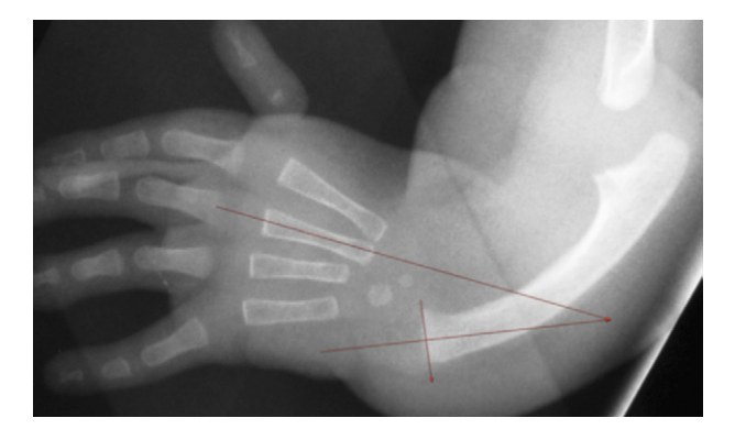
FIGURE 1: Hand-forearm angle according to Geck et al.<sup>5</sup>

We reviewed retrospectively the cases of Bayne and Klug Type III or IV radial longitudinal deficiency treated with prior soft tissue distraction and radialization in our institution. Our purpose was to evaluate the