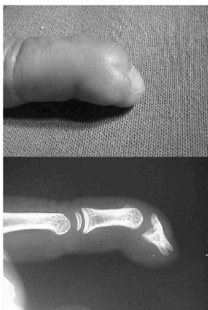
Four-year-old girl 2 years after trauma (case 1). Sixty degrees flexion deformity, shortening and hammer-like aspect due to terminal phalanx epiphysodesis.

No distal bony resorption occurred in any of the cases. Radiographically, the grafted phalanges grew in the same proportion at follow-up as did the control toe. MRI confirmed that control fifth toe middle phalanges did not have a classic proximal epiphysis and behaved as flat bones, with peripheral growth. In comparison, all proximal and distal toe phalanges, and the middle phalanx of the second and third toes behaved as long bones, with a proximal epiphysis whatever the age.